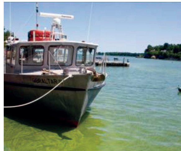
A cyanobacterial bloom in Lake Erie. It's impossible to tell visually, by taste or odor whether such a bloom is toxic (a HAB). Water samples must be analyzed for the presence of toxins.