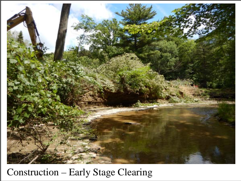
Construction – Early Stage Clearing