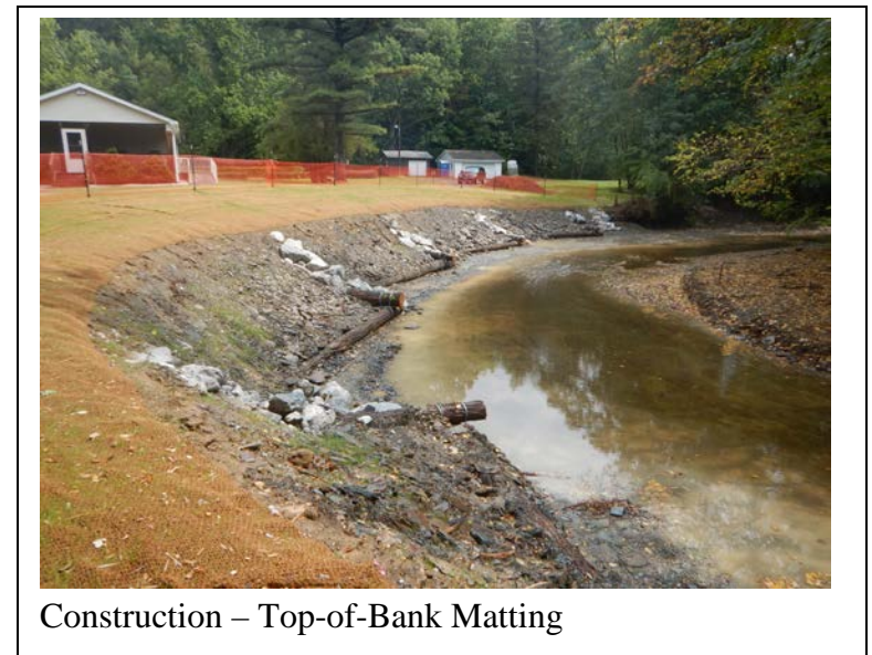
Construction – Top-of-Bank Matting