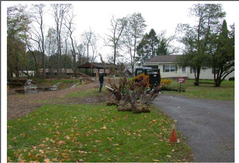
Native Plants Arrive