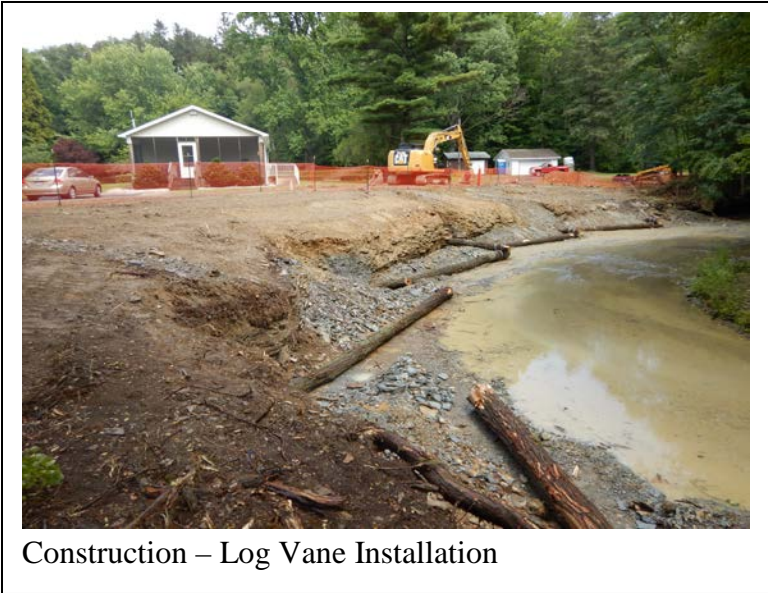
Construction – Log Vane Installation