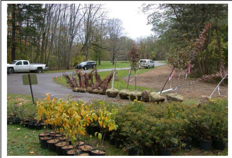
Native Plants Arrive