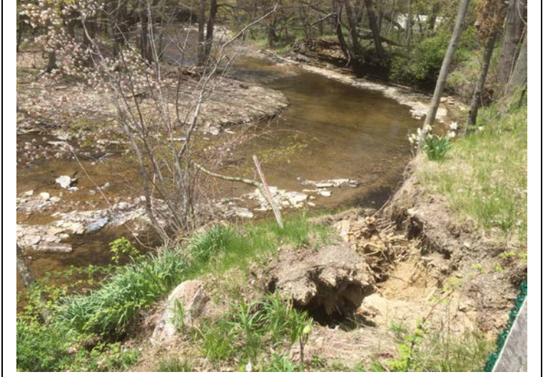
Pre-Construction – Slump near Fence and Driveway