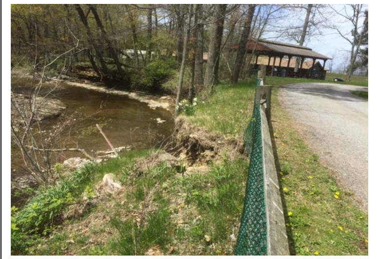
Pre-Construction – Slump near Fence and Driveway