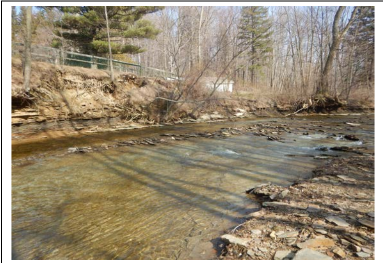
Pre-Construction - Bank Erosion