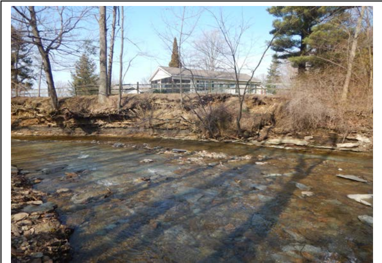
Pre-Construction - Bank Erosion