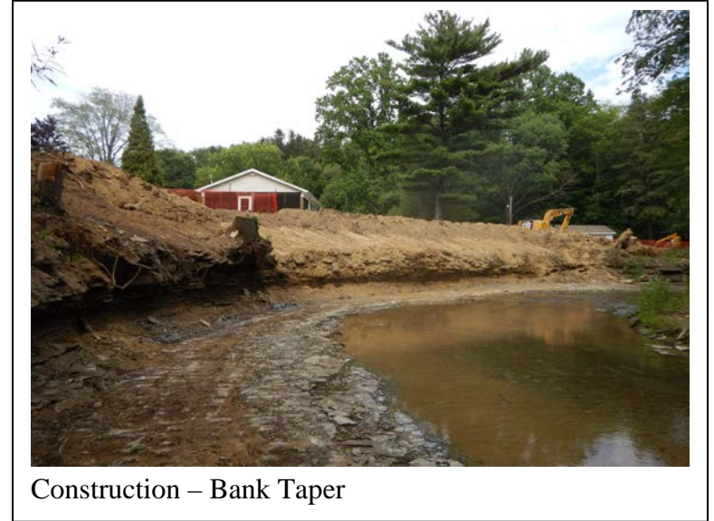
Construction – Bank Taper